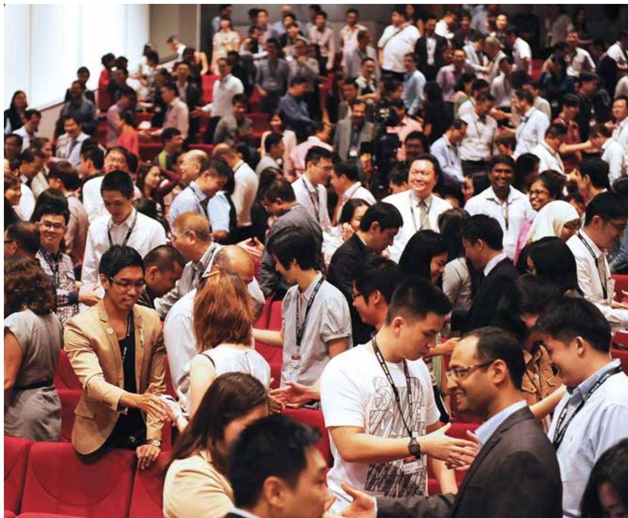
Participants at the Future Leaders Summit shaking hands as an ice breaker before the start of the day's session.

Tripartism in Singapore is pro-business and pro-workers, which are two sides of the same coin, he added.