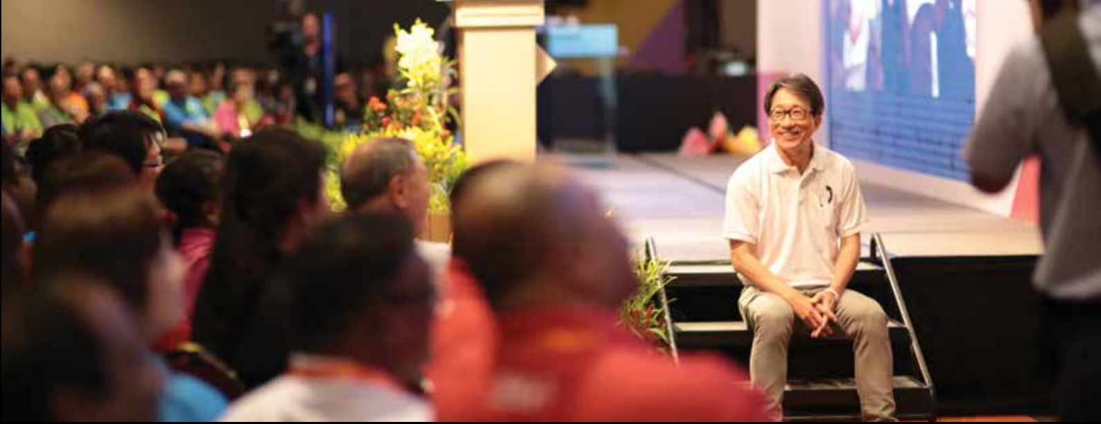
20. Taking a quick moment out to look at the audience watching a video – NTUC Secretary-General Lim Swee Say.