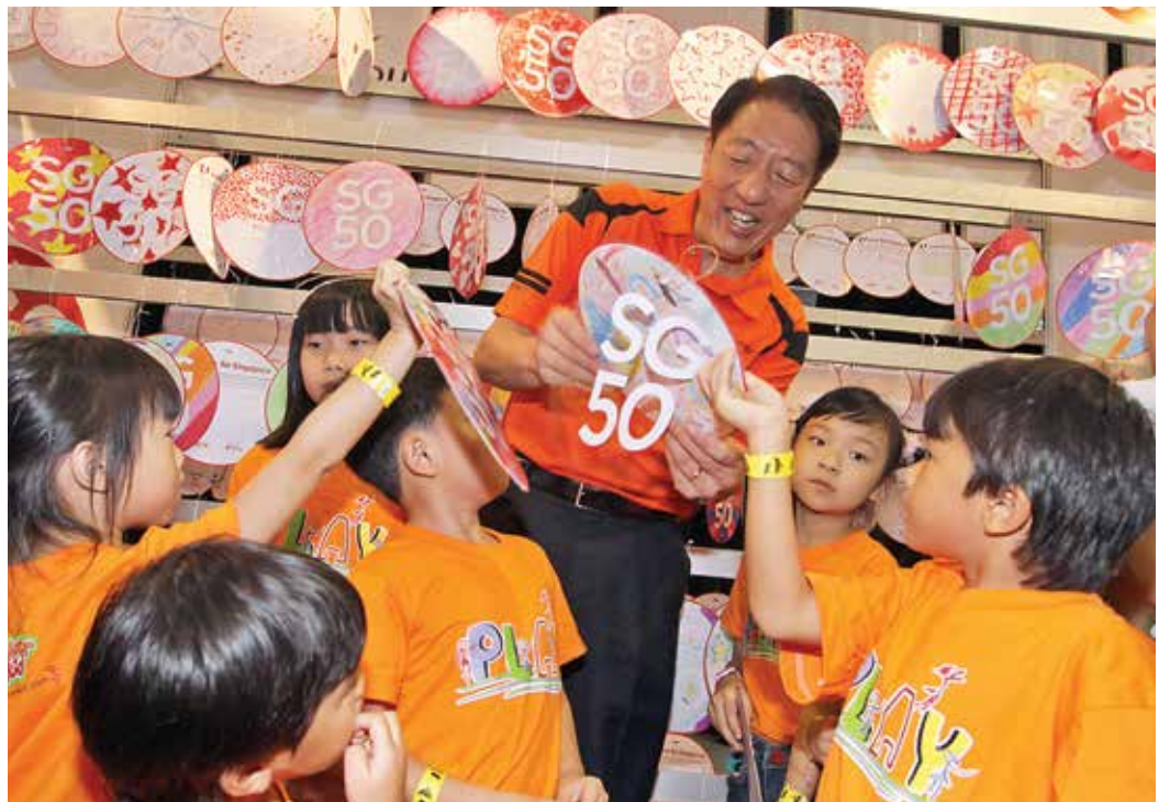
DPM Teo sharing a light moment with the kids at the Family Recreation & Fun Carnival.

The NTUC Care and Share Department also announced the start of a year-long campaign 'U Care for Singapore – Celebrating SG50'. U Care beneficiaries and supporters are invited to design SG50 cards to the theme of 'Hope, Heart and Home' and pen their well-wishes for the nation's 50th birthday. The cards will then be collated and put on mass display next year.