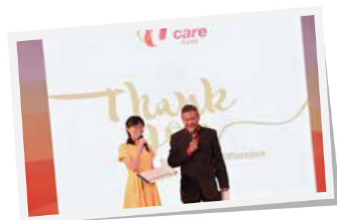
Presentation of tokens of appreciation to donors and sponsors