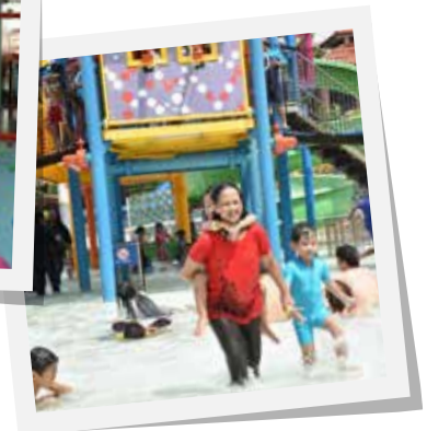
Families enjoying themselves at the various activities and attractions