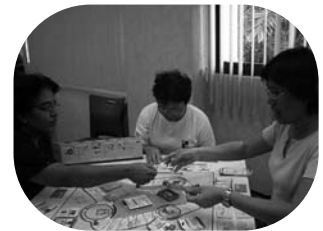
Count it fast and count it right!