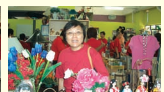
A visit to the JuiceWorks, a self-sustaining juice and sandwich bar operated by outpatients, and the Thrift Store.