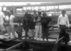
Treading the beaten planks with caution

Although everyone was bushed by the end of the day, it was a trip that ended on a happy note for all, especially the children, who had fostered firm friendships and gained new-found friends during this trip.