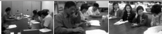
The final hours of negotiation and signing of the memorandum of agreement on the retrenchment

On top of that, the union also helped to facilitate arrangements for NTUC Careerlink and Keppel Employees’ Union to meet up with the affected workers. In the process, there were also several informal discussions with members to raise their concerns and feedback to management.