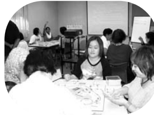
Yes I'm winning!