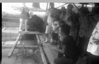
Demonstration at the Kelong