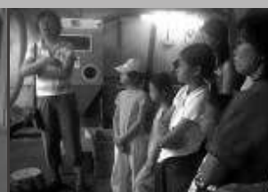
Visit to the Pewter Factory