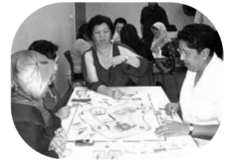
Hang on, it's my turn to move now!