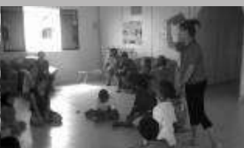
The Nanny with her kiddies