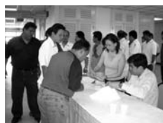
Explaining the information kit to our members

The union produced an information kit for the members which highlighted to them the components in their retrenchment package as well as the various sources of assistance they can seek in the event of hardship.