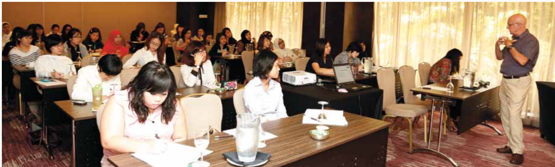
In-service teachers were briefed on the details of the International English Language Testing System (IELTS) 6.5 equivalent at the Early Childhood Career Fair 2012.