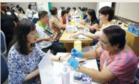
Active agers were also provided opportunities for health checks at the event.

There were 15 PME (Professionals, Managers and Executives) job positions with minimal gross starting salaries at $2,000. The rank-and-file full time positions offered gross starting salaries of $1,000 and above. Both full-time and flexi as well as part-time options made an attempt to attract these seniors back to the workforce. From accounts executives, customer services officers, product executives, retail supervisors and technicians, there was a buffet of positions for the 3,000 seniors who participated at the symposium held for the third consecutive year.