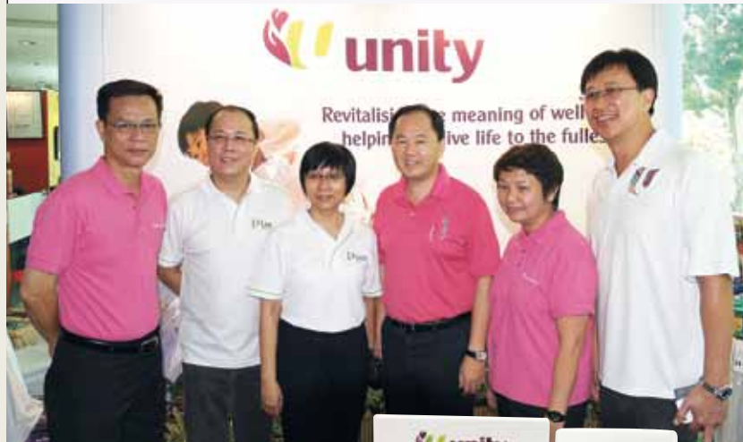
NTUC Unity Healthcare unveiled its first batch of housebrand vitamins and supplements on 22 July 2012.