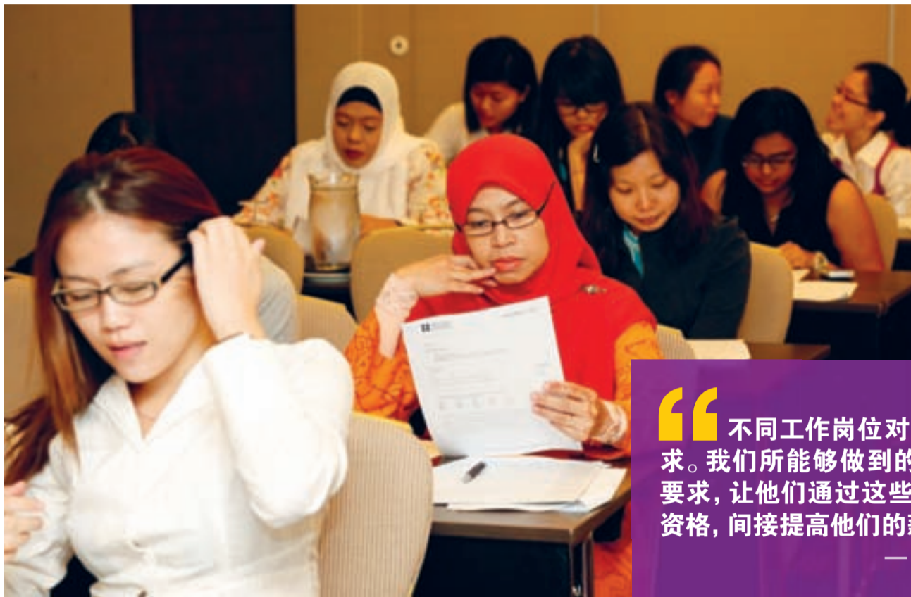
约40名进行雅思鉴定测试的学前教育教师，将有机会获得学费和考试费津贴。

“不同工作岗位对学历和职责方面有不同要求。我们所能够做到的是，让在职员工达到这个要求，让他们通过这些课程具备胜任这份工作的资格，间接提高他们的薪金。”