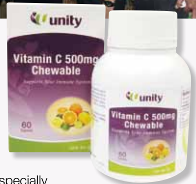
By Naseema Banu Maideen

NTUC Unity's shelves will now carry its own housebrand products at affordable price