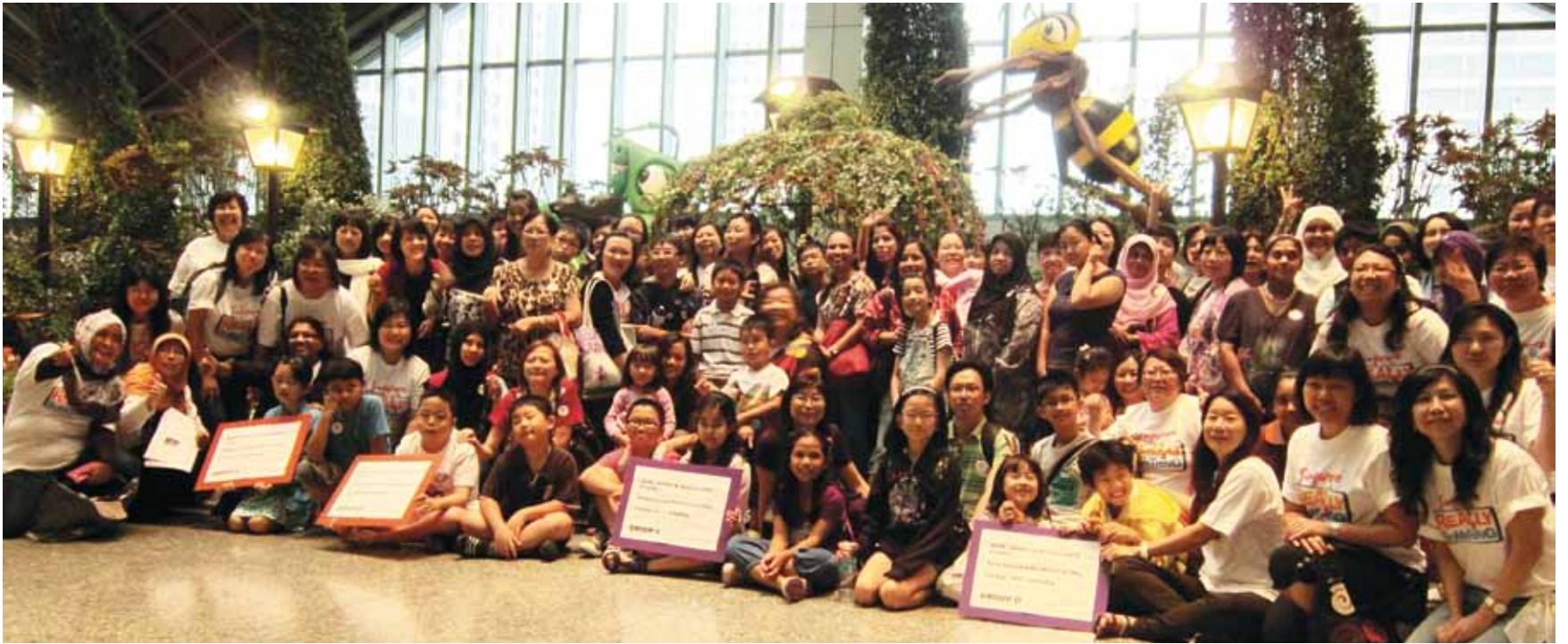
65 single mums and their little ones had sensory treats at the Singapore Garden Festival on 14 July 2012.