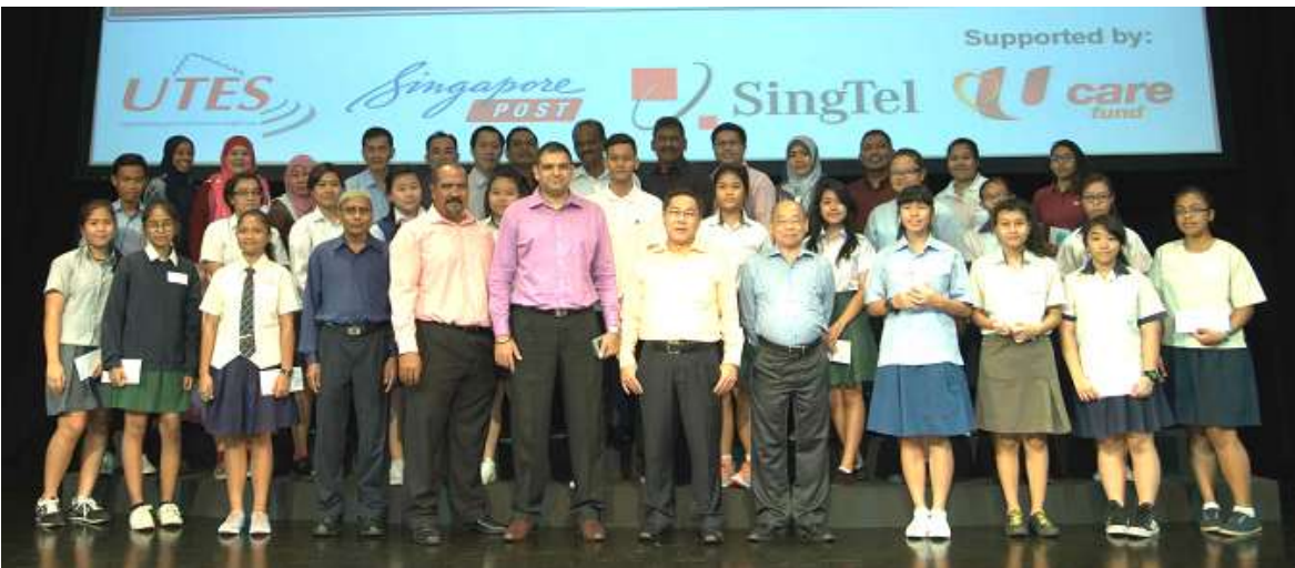
Secondary & ITE Awardees with UTES Executive Councilors