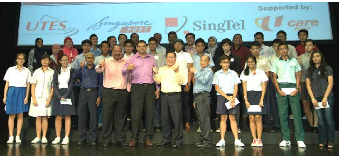
Secondary & ITE Awardees with UTES Executive Councilors