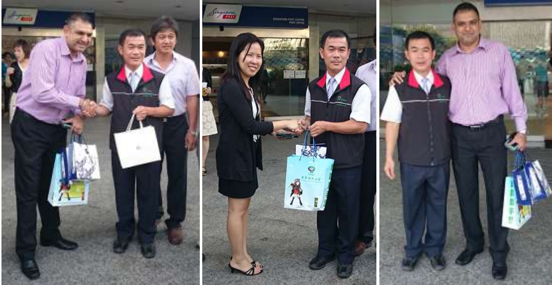
Exchange of mementos between UTES and CPWU