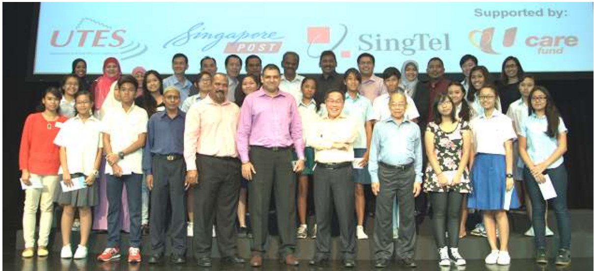
Secondary & ITE Awardees with UTES Executive Councilors