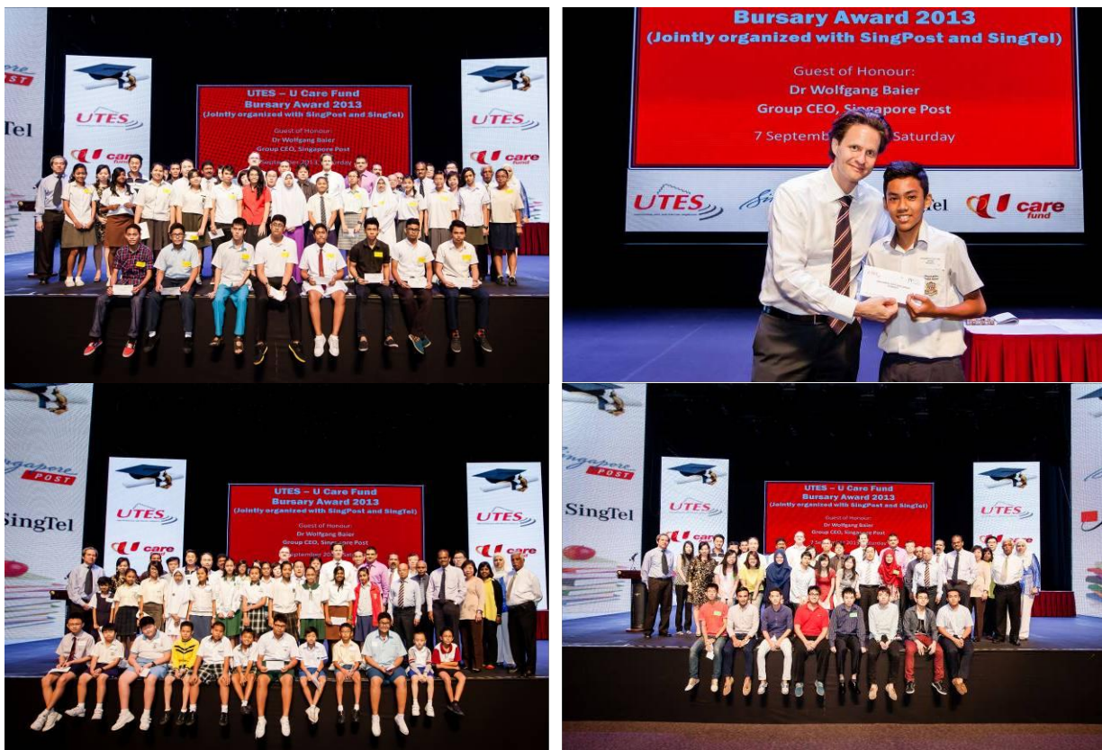
UTES – U Care Fund Bursary Awards Ceremony held on 7 September 2013 at Kallang Theatre

For the year 2013, there were 386 successful awardees and the total award value was $145,300.