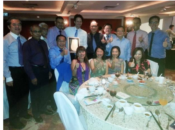
May Day Awards Ceremony held on 28 April 2013 at Orchid Country Club, Grand Ballroom.