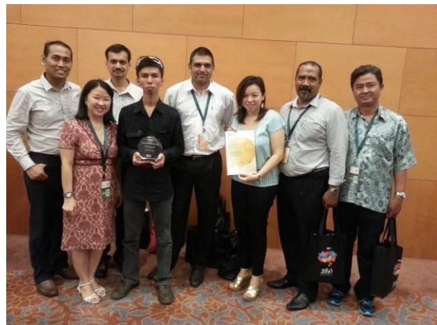
May Day Model Partnership Awards Ceremony on 18 May 2013 at the Compass Ballroom, Resorts World Convention Centre, Sentosa