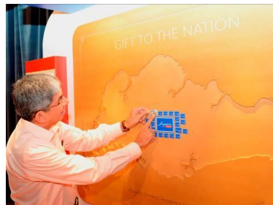
Iftar Event held on 29 July 2013 at SPC Theatre