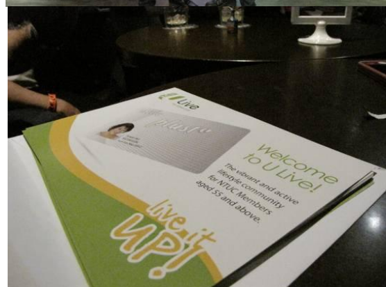
Launch held on 16 August 2013 at Scarlet City