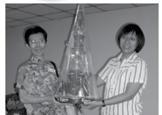
Lucky Draw winners - SGH Friday Nite Fever

We hope to see you again at the next round of Branch Activities