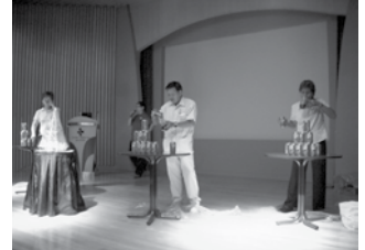
Root Beer Challenge at CGH Member's Nite

Our branches have been busy organising activities and roadshows for their members. Catch glimpses of these events in these photo specials.