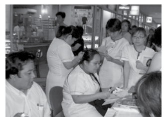
Enthusiastic responses to the KKH Roadshows