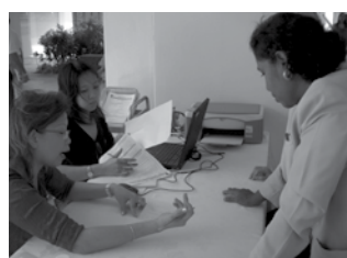
Member signing up for GIRO deduction of subscription fees