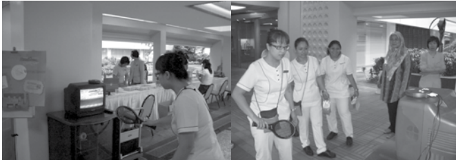
Members enjoying a virtual tennis game at the SGH Roadshows in August 2005