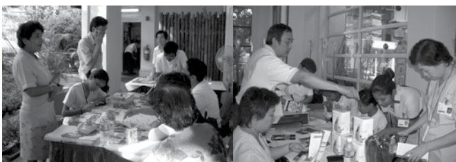
Some of the 60 new members who sign up for membership at the AH Roadshows