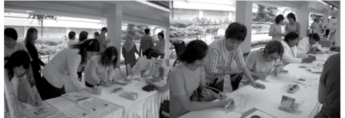
Non-members signing up as members at the SGH Roadshows in August 2005