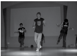
Hip Hop Dance at CGH Member's Nite