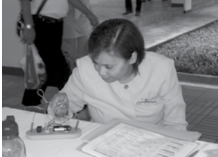
Member enjoying a Steady Hands game at the SGH Roadshows