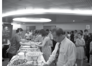
Members enjoying the sumptuous spread Members' Nite at CGH

Our branches have been busy organising activities and roadshows for their members. Catch glimpses of these events in these photo specials.