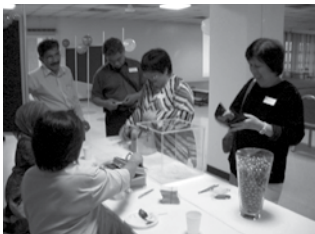
Guess the Marble at Friday Nite Fever at SGH