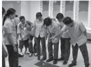
Trying their hands at the putting game at Friday Nite Fever at SGH on 23 Sep 05