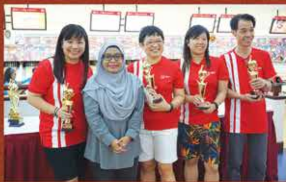
3RD PLACING - AIA SINGAPORE PTE LTD TEAM A