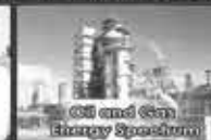
Oil and Gas Energy Spectrum