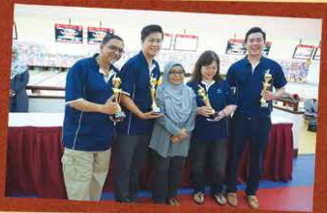
2ND PLACING - TOKIO MARINE INSURANCE SINGAPORE LTD TEAM A