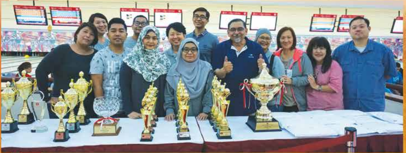
SIEU Sports & Recreation Committee