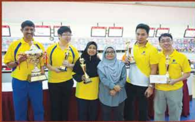
CHAMPION - AVIVA LTD TEAM C