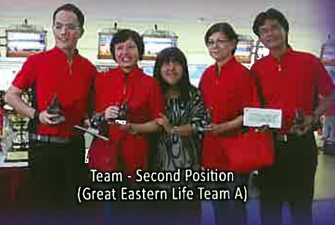
Team - Second Position (Great Eastern Life Team A)