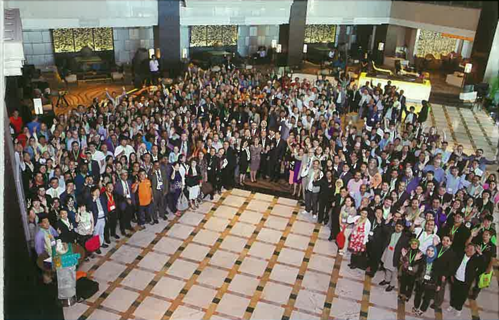
Group Photo with Thai DPM