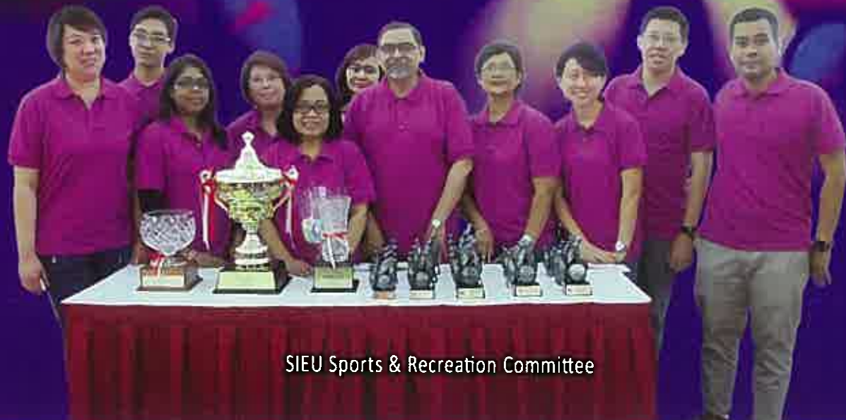
SIEU Sports & Recreation Committee