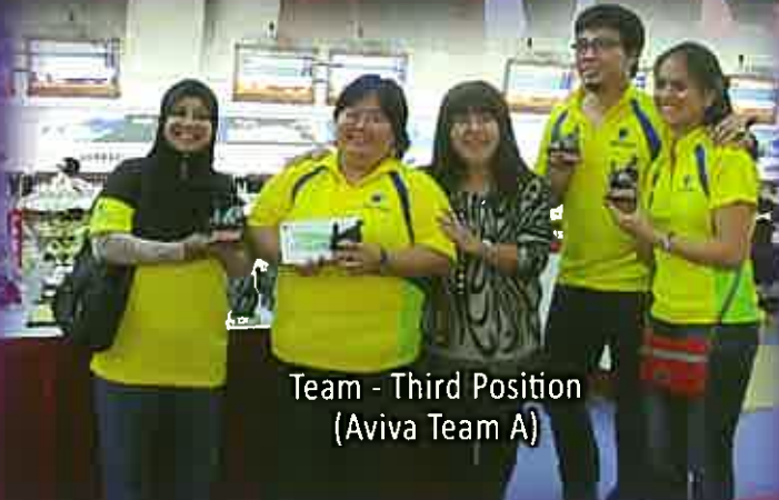
Team - Third Position (Aviva Team A)