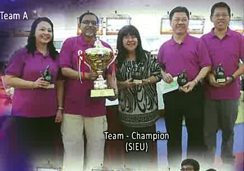
Team - Champion (SIEU)