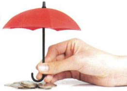
Table of benefits for Death and Permanent Disability

Group term life insurance policy coverage of up to $40,000*