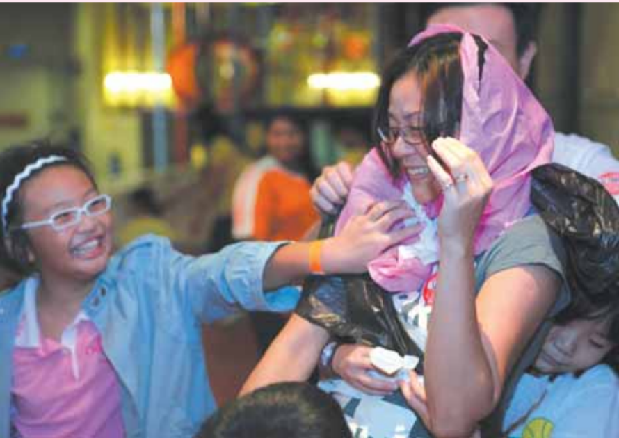
Strengthening family bonds by dressing mummy up.

with her newly won 1.5 million LinkPoints, she is receiving more than what she paid for her entire membership dues. She said enthusiastically: “It’s fantastic to win 1.5 million LinkPoints! I couldn’t sleep the whole night after they informed me. I’m very happy and excited! I have an NTUC Thrift account so I’ll probably convert some LinkPoints there and use some as vouchers.”