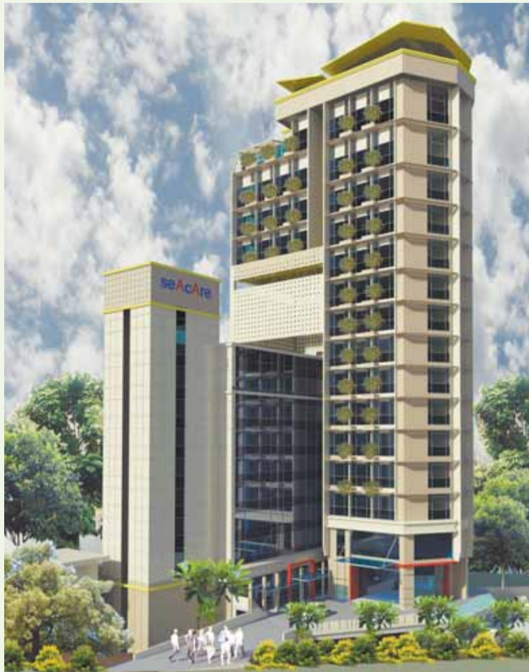
An artist's impression of the Seacare Hotel (right) which is next to the existing Seacare Building.