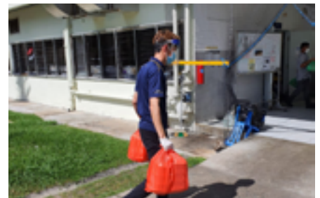
Daily food distribution