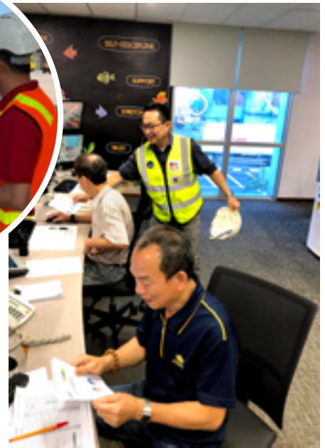
Explaining to workers how to protect ourselves and others at work