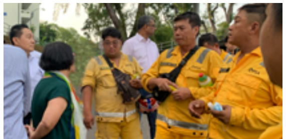
Visiting our Malaysian members staying in the PSA dormitories during the MCO.