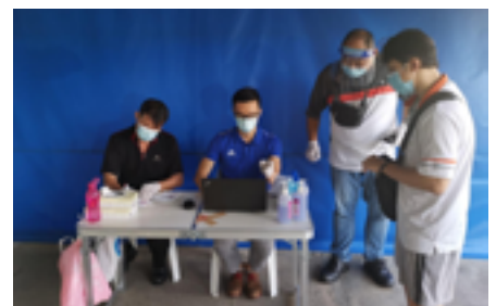
Assisting in registration for swab test

We asked two of our Exco volunteers to share their experiences.