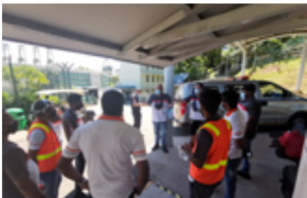
Daily briefing to helpers

Our union leaders stepped up and volunteered to help the task force for dormitories set up to tackle the Covid outbreak*.