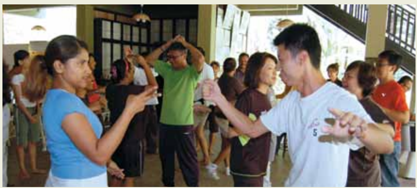
Through a new twist to the classic game of Scissors Paper Stone, the BOs learned that rising through the ranks cannot be left to a game of luck; instead it must be through good leadership.