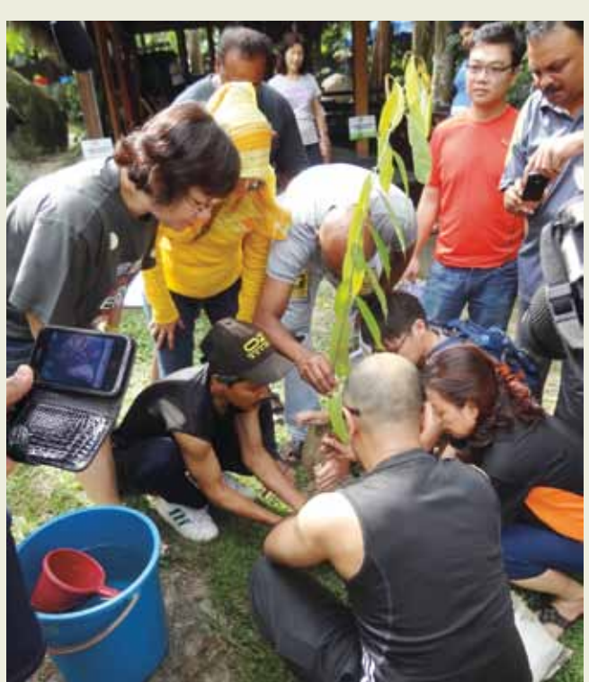
Chipping in to plant the SMMWU teak tree on the Tanah Aina Farrah Soraya premises.