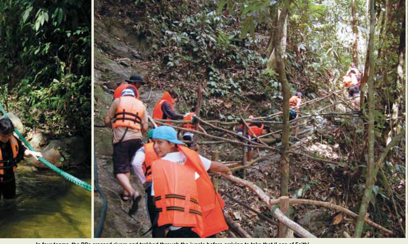
In four teams, the BOs crossed rivers and trekked through the jungle before arriving to take that 'Leap of Faith'.