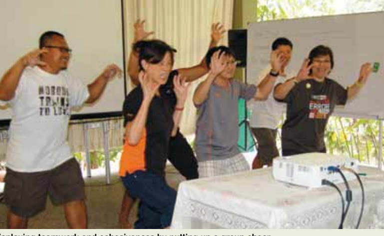
Displaying teamwork and cohesiveness by putting up a group cheer.

During the game, when we were asked to describe our experience here in one word, the first word that came out from my mouth is 'acceptance'. For me, this whole course is more about sharing, willingness to learn from others and the acceptance is to accept people's suggestion."