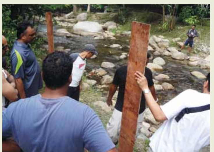
Teams deliberate on the best and fastest way to complete the challenge with the tools they were given.