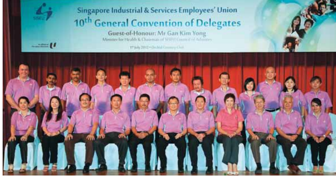
The union ushered in a good number of new leaders to refresh its leadership beat.