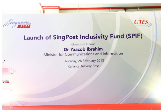
Launch of SingPost Inclusivity Fund

The fund was launched on 28th February 2013 at Kallang Delivery Base by Dr Yaacob Ibrahim, Minister for Communications and Information.