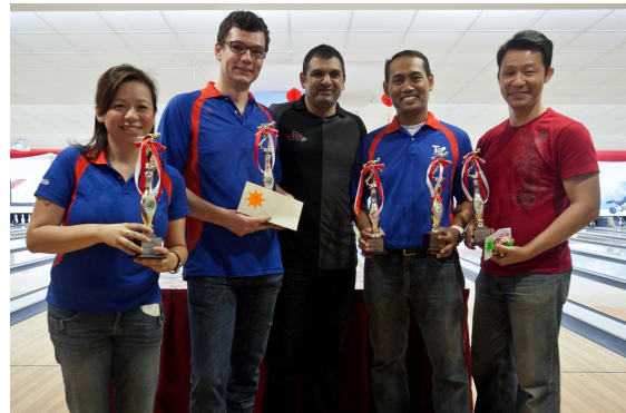
Team 1 st Runner-up: SingPost Management