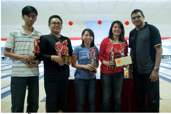
Team 4 th Runner-up: Quantum Solutions Management