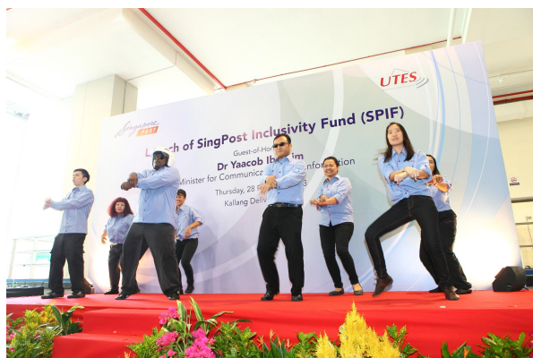
Staff from SingPost wow the audience by dancing the popular 'Gangnam-style' song