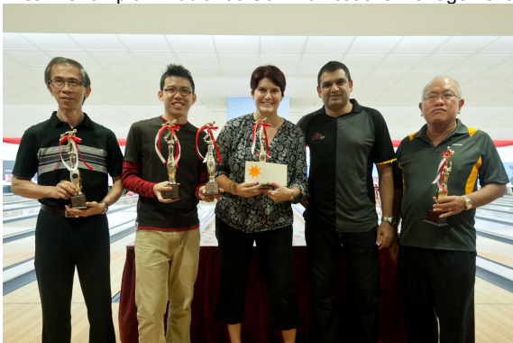
Team 2 nd Runner-up: SingTel Management