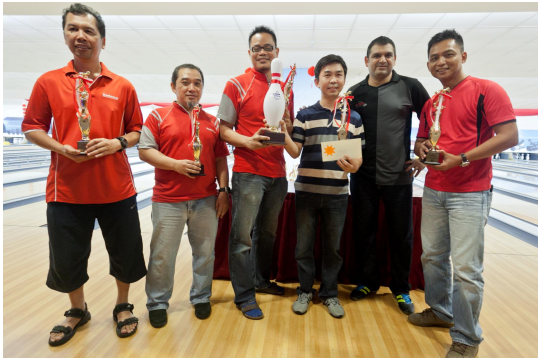
Team Champion: Radiance Communications Management