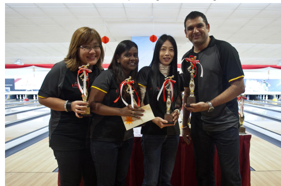
Team 3 rd Runner-up: UTES Headquarters