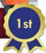
NTUC INCOME INSURANCE CO-OPERATIVE LTD TEAM A