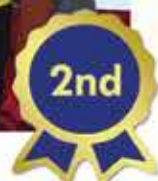
AVIVA LTD TEAM C