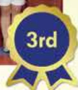
AIA SINGAPORE PTE LTD TEAM A