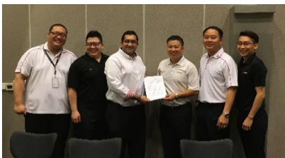
A new agency, Soverus Consultancy & Services Pte Ltd is unionized with USE on 13 Jun 2016

Team USE has successfully signed 3 Collective Agreements (CAs) and 4 Memoranda of Understanding (MOUs) since January 2016. As at 30 June 2016, we now have a total of 88 CAs and MOUs.