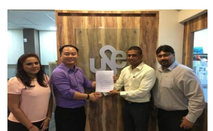
Crete Security Services Pte. Ltd has signed their first Collective Agreement on 16 June 2016