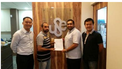
A new agency, Asset & Crowd Management Specialists Pte Ltd is unionized with USE on 21 Jun 2016