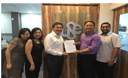
Premier Security Co-Operative Ltd has renewed their Collective Agreement on 6 June 2016