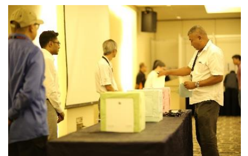
USE Delegates casting their votes at the Secret Ballot