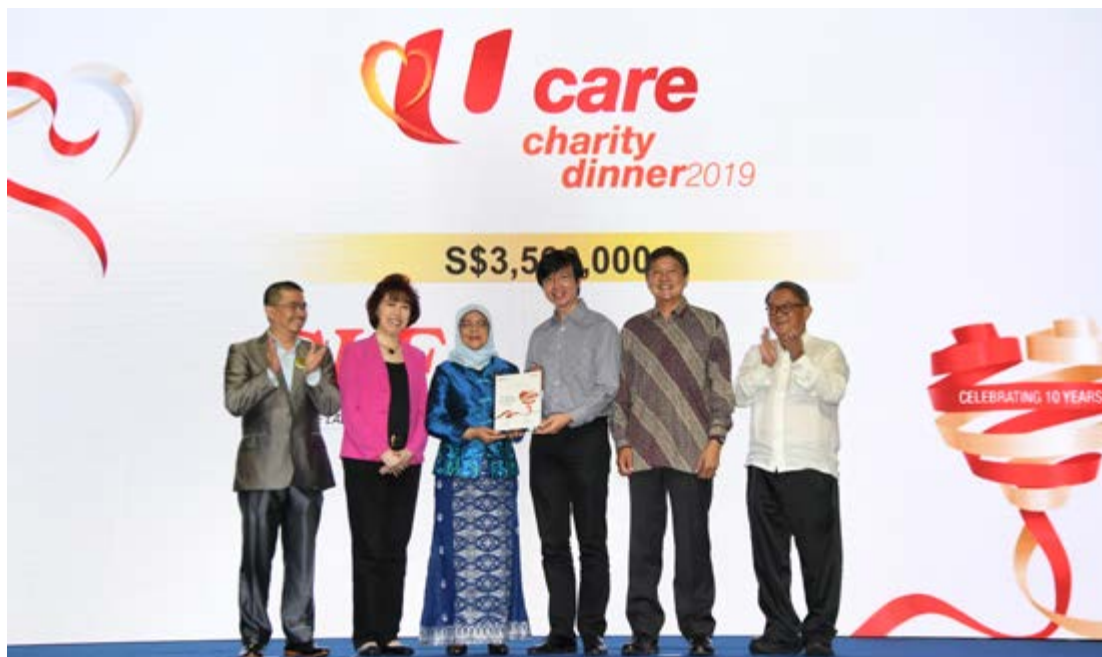
Token of appreciation presented to the Singapore Labour Foundation for their donation of $3.5million.