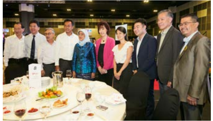
Guests sharing a group photo with President Halimah Yacob.

The Charity Dinner was attended by more than 800 guests, including Donors from NTUC-affiliated unions/associations, NTUC Social Enterprises, corporate, tripartite and management partners together with our U Care beneficiaries.