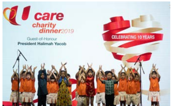
Students from My First Skool, including beneficiaries of Bright Horizon Fund, put up a performance for the guests.