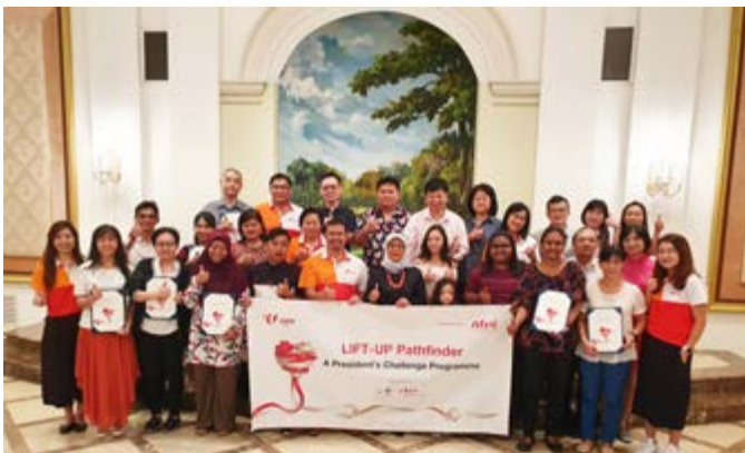
President Halimah Yacob presented certificates to families who had completed the programme.

Since 2018, the programme reached out to some 70 families, helping them understand change management and learn how to reach their ideal future state through proper goal setting and upskilling.