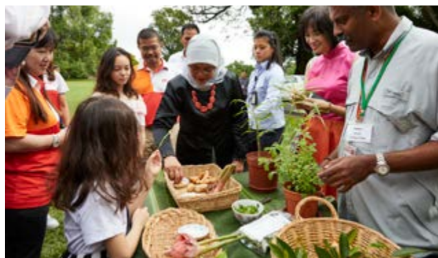
President Halimah Yacob hosted the LIFT-UP Pathfinder graduands to a Garden Party at the Istana.