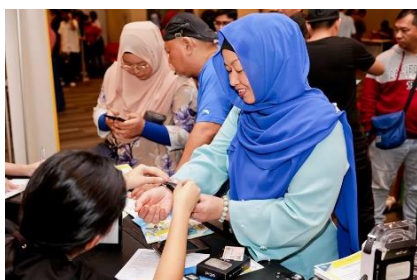
Health Promotion Board roadshow booth to promote the National Steps Challenge and distributed a free steps tracker watch to the participants to encourage healthy lifestyle of our security officers and their family

For 2018, the 13th USE Executive Council and 4 unionised companies listed below sponsored bookprizes for the benefit of our members.