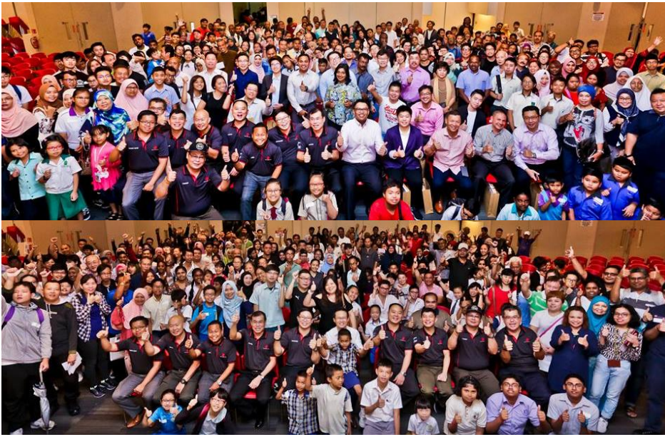
M Sanji Education Awards 2018