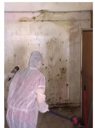
USE volunteers doing house cleaning under the Project Refresh program by Young NTUC

Over the last 6 months, USE Branch Officials (BO) spent some of their off days serving the community through projects spearheaded by Young NTUC and NTUC Women's Committee.