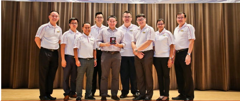
USE M SANJI EDUCATION AWARDS 2016