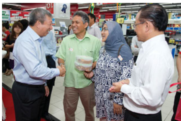
Beneficiaries of U Care Fund who were invited to the launch event.