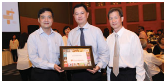
Token of appreciation were presented to all donors.