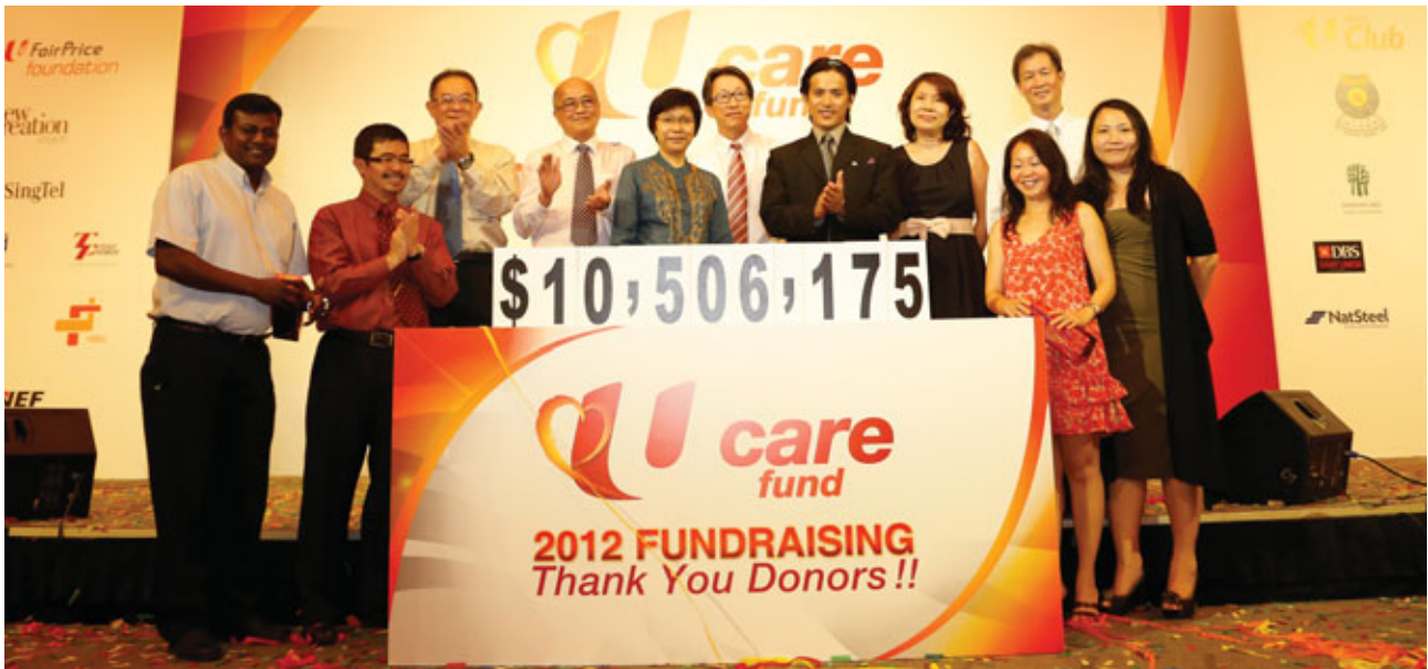
The 2012 fundraising target of $10.5 million met.

The U Care Charity Dinner was the U Care Fund's main fundraiser in 2012. More than 900 guests attended the dinner, witnessing the achievement of the year's fundraising target of $10.5 million. The dinner was also a platform to show appreciation to all U Care Fund donors and sponsors, including NTUC-affiliated unions and association, Singapore Labour Foundation, NTUC Social Enterprises, unionised companies, corporate and individual donors.