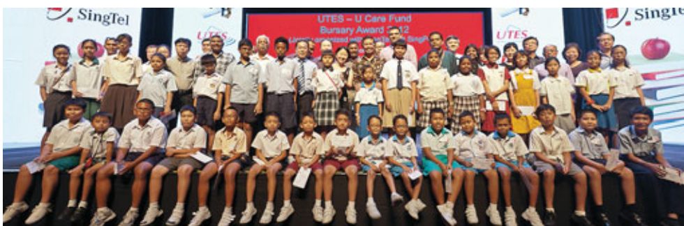
Thirty-five unions tapped the U Care Education Co-Funding in 2012 for their education awards.