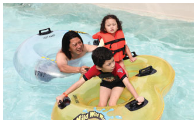
A member and his children having some family fun at Wild Wild Wet.