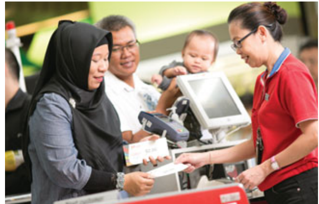
U Stretch Vouchers help defray cost of living and daily necessities for low-income members and their families.