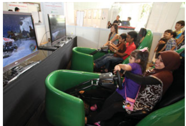
Besides enjoying great deals on a wide range of school related merchandise, members also enjoyed the various educational talks, workshops, meet-the-author sessions and activities that were organised during the Back to School Fair.