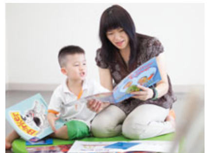
The Read-to-REACH literacy programme helps children who are weak in English develop interest in reading and in recognition of letters and pronunciation.