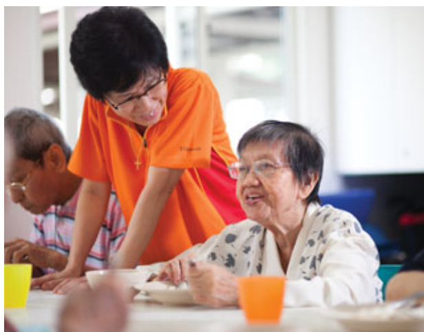
Seniors at the Silver Circle centres engaging in games and activities.