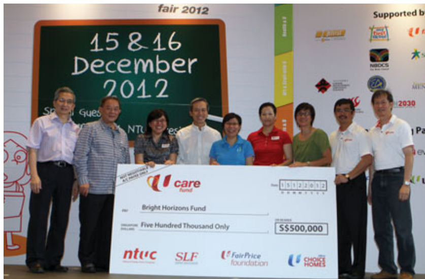
U Care Fund's donation to Bright Horizons Fund helps to assist children from low-income families to attend quality pre-school at My First Skool centres.

Family and School Together (FAST) is another BHF programme which aims to provide the young learners greater exposure to outside of school environment by sponsoring both children and their parents from lower income families through learning outings.