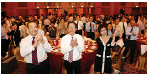
Guests joining in during the final sing-along.