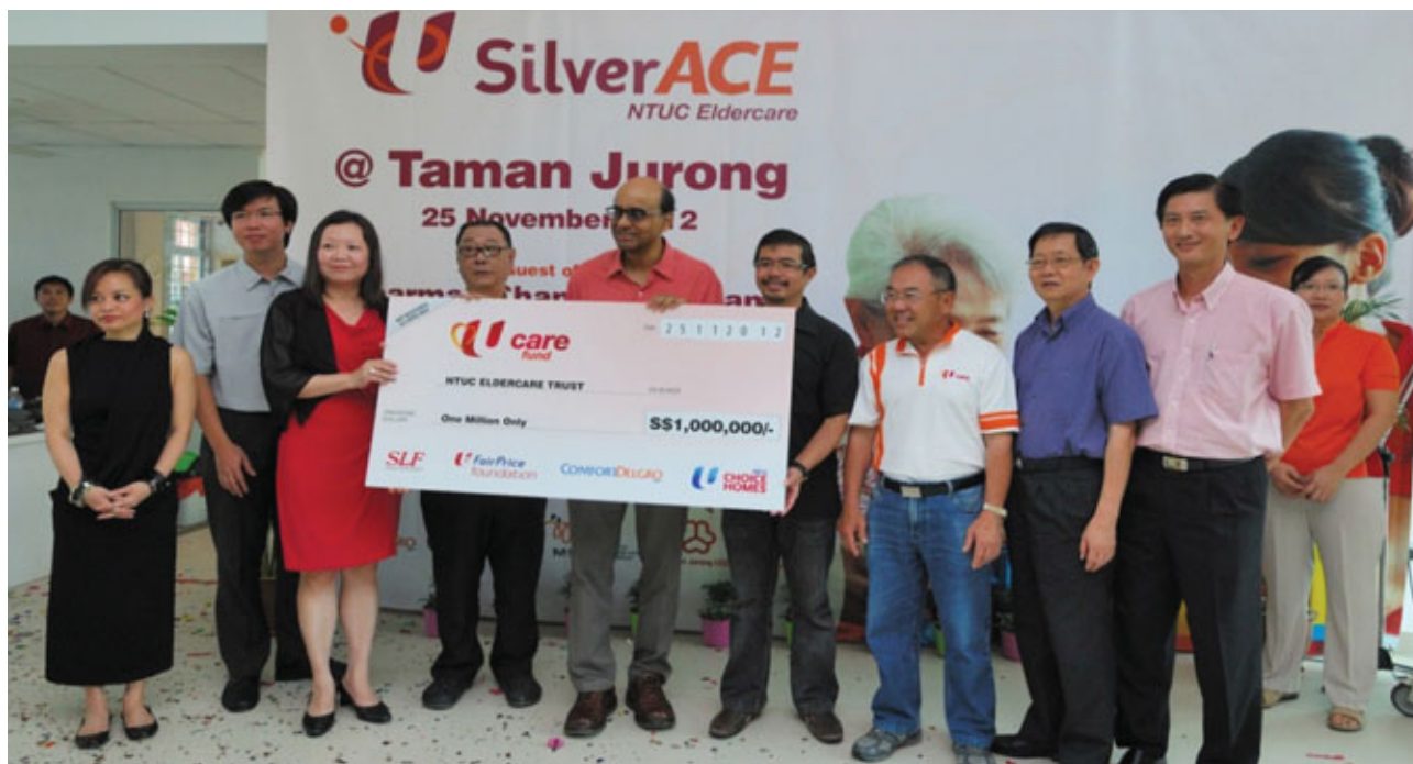
U Care Fund's donation to NTUC Eldercare Trust helps support the welfare of the elderly.

These include enhancing day care and home care services, as well as fee subsidies to help middle to lower-income families who enrol their elderly parents in the day care programme. With this donation, NTUC Eldercare could further enhance its day care and Care@Home services.