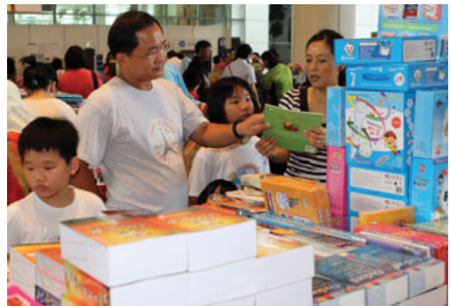
The Back to School Fair complements the Back to School Voucher Programme by offering greater discounts, thereby helping members to stretch their dollars on school needs for their children.