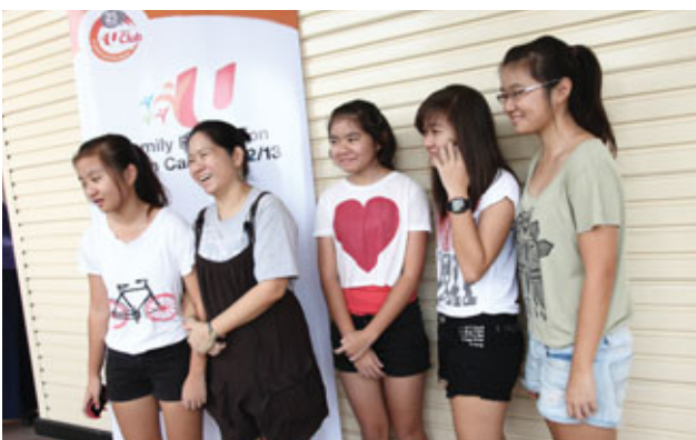
A member and her children who look forward to the FRF every year.

In 2012, some 10,000 families attended the carnivals and enjoyed a fun day out at Downtown East.