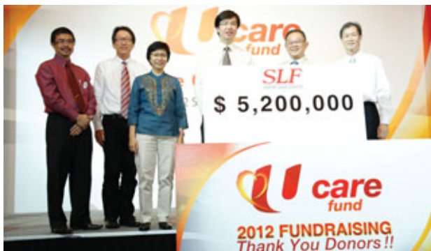
Singapore Labour Foundation was U Care Fund's biggest donor with a pledge of $5.2million in 2012.