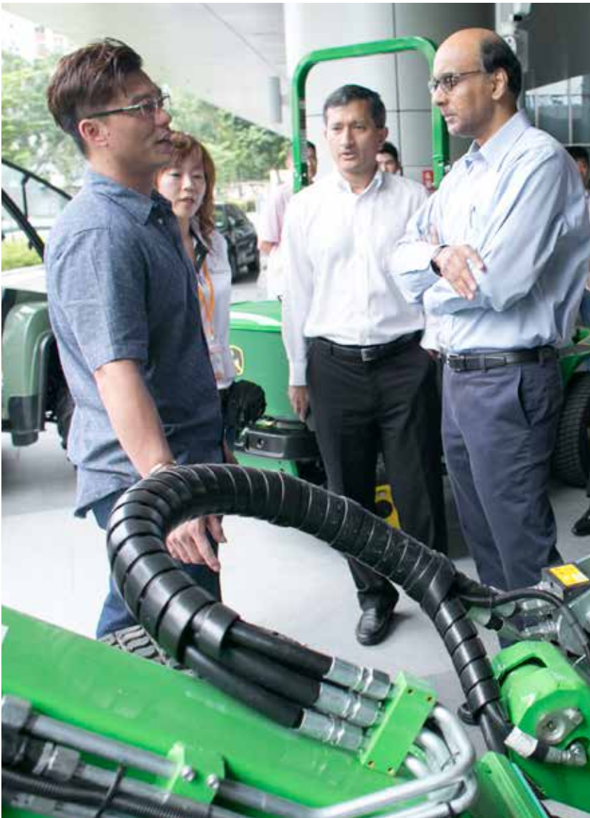
Deputy Prime Minister and Minister for Finance Tharman Shanmugaratnam (right) in conversation with a participant at the event. Looking on is Minister for the Environment and Water Resources Vivian Balakrishnan (second from right).

Progressive versus Minimum: We zoom in on who's adopting what wage model where around the world and how it impacts low-wage workers.