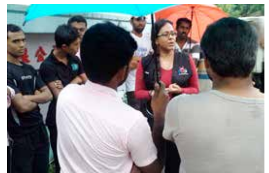
An MWC Officer giving advice to the affected workers of Interprime Contractors.

Following their visit, the MWC team kept a close watch on proceedings as the Ministry of Manpower (MOM) worked with the company's Managing Director to resolve the payment of salary arrears. The team also updated