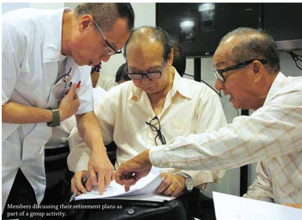
Members discussing their retirement plans as part of a group activity.