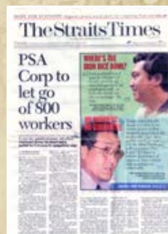
News articles published by various media in 2003

Then, PSA Corporation had to restructure its businesses to support its global focus and ensure that it remained responsive to developments in the port industry.