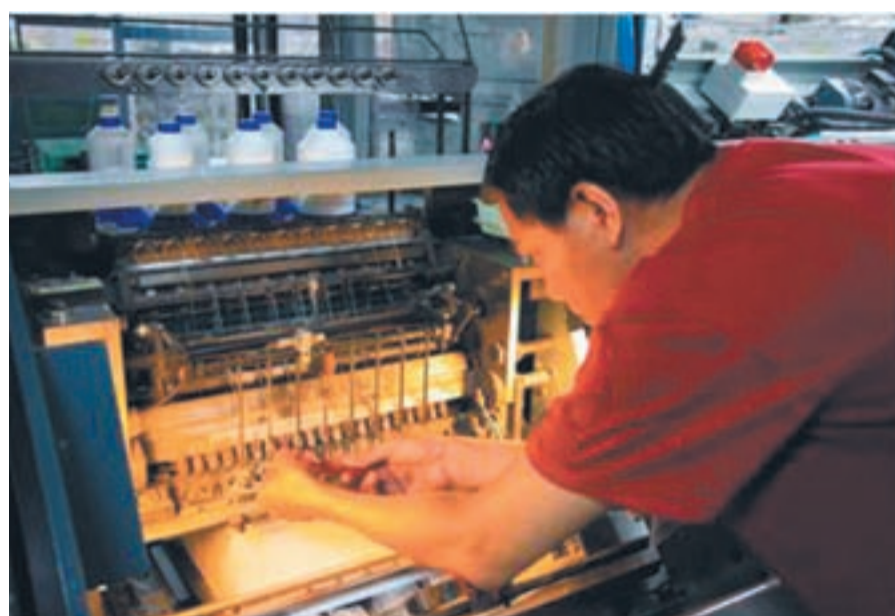
Older workers have a wealth of experience to share.