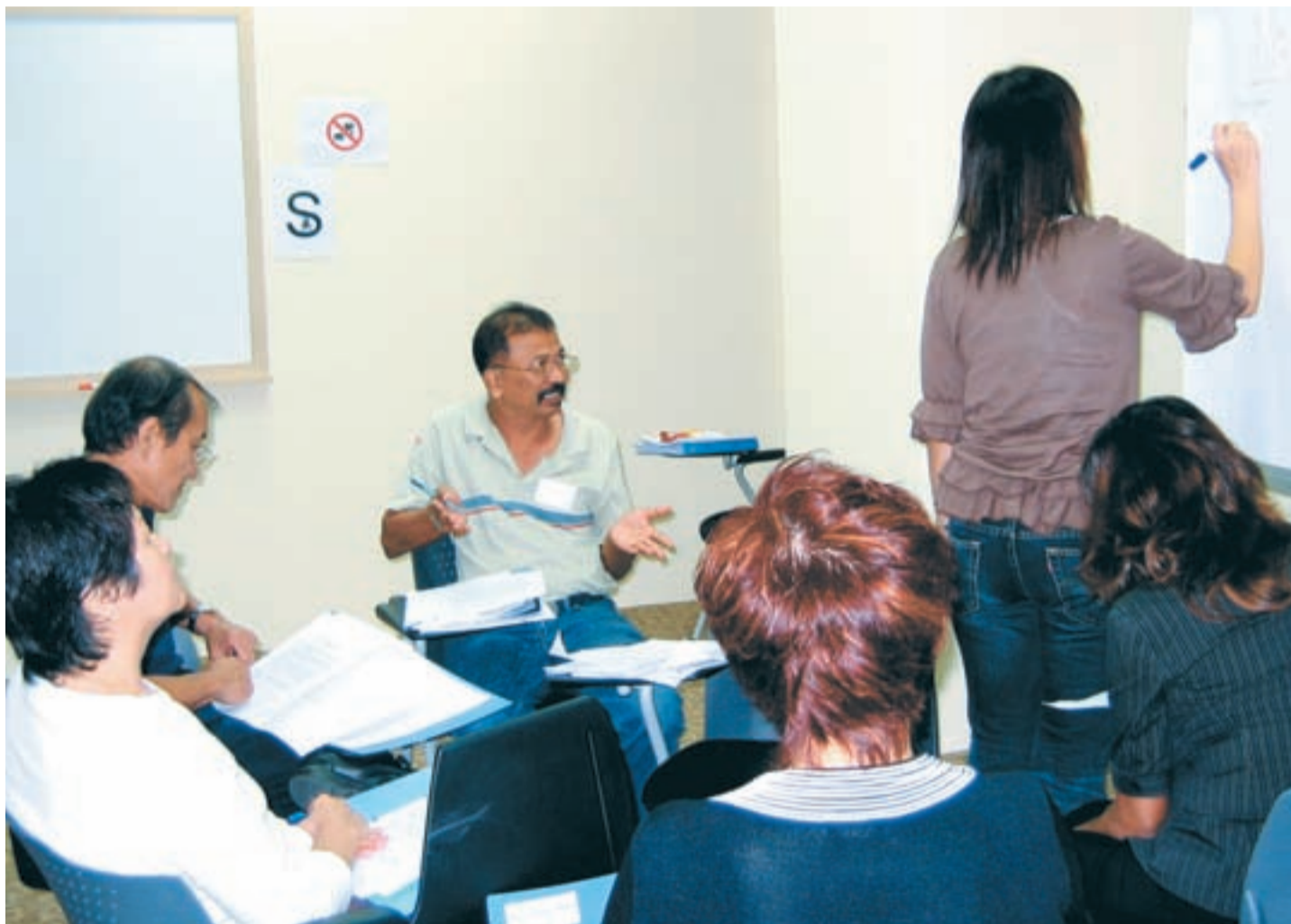
A group discussion... All part of the learning process for these "students" in a recent SEG session.