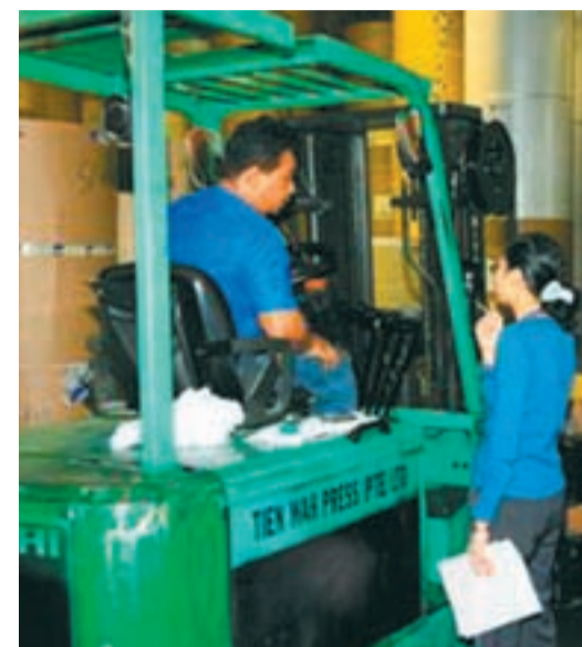
Redesigned job processes and more sophisticated machinery have made light work for the older workers at Tien Wah Press Private Limited.