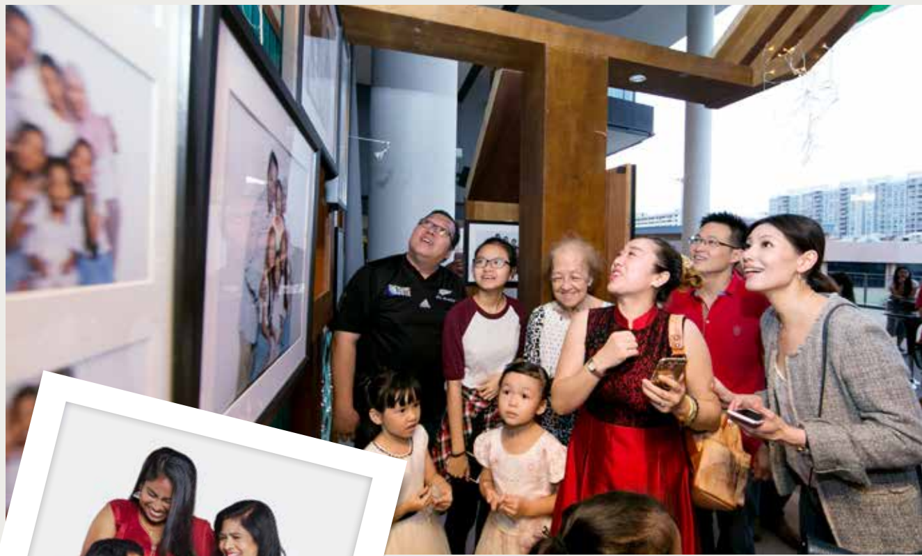
SUBE Executive Secretary Desmond Choo (second from right) and Sharon Au of styleXstyle (extreme right) unveil a portrait together with a family.