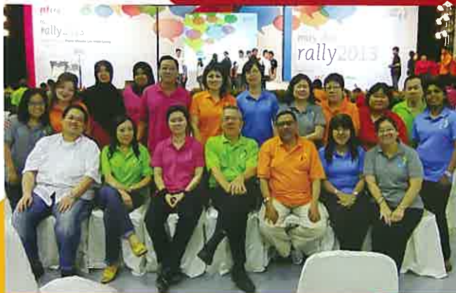
May Day Rally 2013 1st May @ Pasir Ris Downtown East