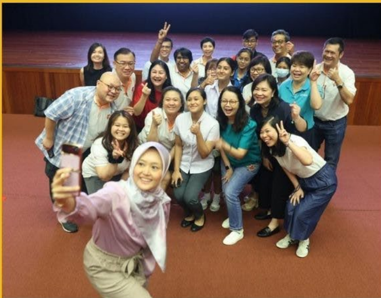
Guest-of-Honour Senior Parliamentary Secretary (SPS), Ministry of Health & Ministry of Law, Rahayu Mahzam was present to mark the significant milestone in the lives of the youths.