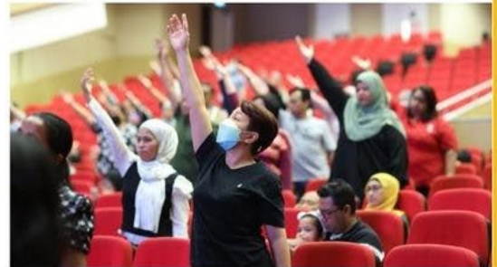
HSEU leaders also had a wonderful time connecting with the youths and their parents and wishing them nothing but the best for the future!